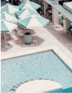
Luxe: clockwise, The Calile; Pumphouse Point; Freycinet Lodge; Hayman Island Resort

You leave all worldly worries behind when you board a helicopter for the brief flight to Long Island, about 20km south-east of Airlie Beach. Boat access is limited due to the