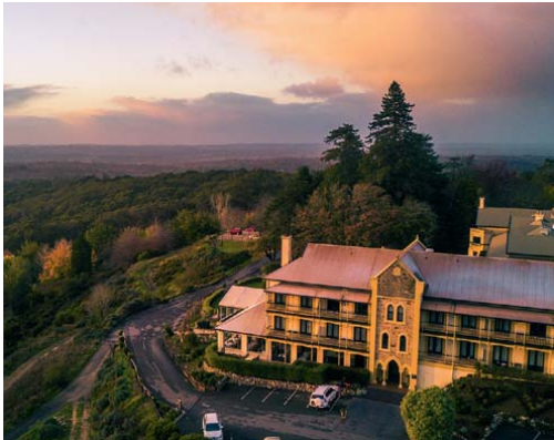
Handsome: Mount Lofty House; MACq 01

ARKABA HOMESTEAD Flinders Ranges You might recognise the ancient Wilpena Pound and jagged Elder Range from the paintings of Hans Heysen and as a cinematic backdrop to countless movies. Five hours by road from Adelaide, this stunning landscape surrounds Wild Bush Luxury’s private Arkaba Conservancy, a 24,000ha former sheep station that’s now a wildlife haven. After a walk or hike with an expert field guide, 4WD tour or heli adventure, retire to the handsome 1850s homestead for a hot shower and restaurant-quality dining, an open bar and sofas for stargazing by the pool. There are only five rooms, and a maximum of 10 guests. From $1070 per person per night, including meals, drinks and safaris. arkabaconservancy.com