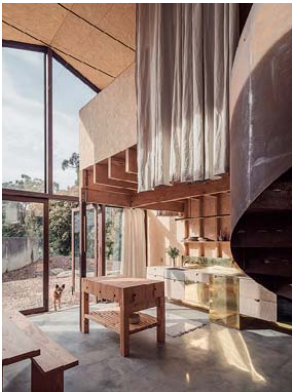
Landmarks: from top, Zagame's; Jackalope; Ross Farm; Lake House