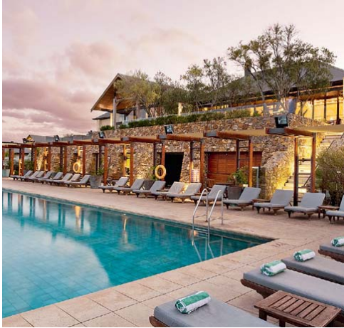
Natural fit: Pullman Bunker Bay; Kimo Estate; Premier Mill Hotel

In the 16 years since it arrived on the awe-inspiring Margaret River surf coast, Bunker Bay has more than proved that a sizeable resort can coexist companionably with nature. The 150 villas (from $279) are nestled discreetly in the bush around the main lodge; each is equipped for self-catering but the restaurant is too good to miss. The lodge overlooking dunes and ocean hums with couples and family groups, with tables spilling out to the olive-tree shaded terrace, beyond which is a heated infinity-edge pool. Kids are welcome; for those who prefer adult company there's the day spa, beach, Cape Leeuwin lighthouse or any of the region's 200-odd wineries. pullmanbunkerbayresort.com.au