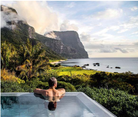
Stylish: Halcyon House; Capella Lodge; Fullerton Hotel