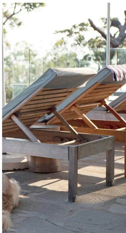
Clockwise from far left: Soldiers Point Jetty, Port Stephens; Wilbur relaxes poolside at Bannisters; service at The Langham, Sydney. PREVIOUS PAGES Dogs at Zagame's House, Melbourne.